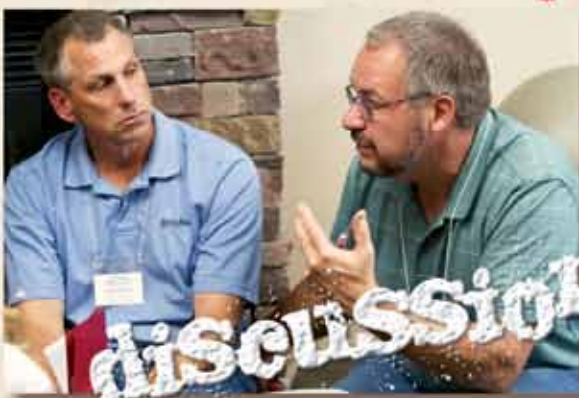
“We explored redemptive biblical principles that apply to the offended, the offender, and the crowd of observers.”